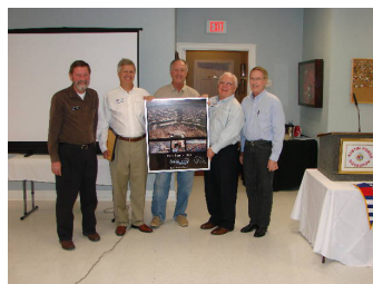
Sail & Ski presents an Aquapalooza poster