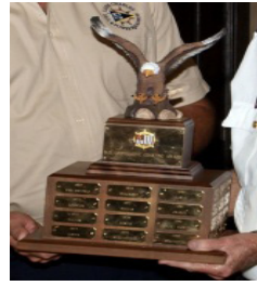
The Clinch trophy for 1st Place in D/21