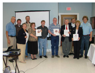
So many awards... So little time at the October meet- ing